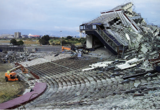
CANDLESTICK PARK/ASBESTOS AIR SAMPLING FOR NATURALLY OCCURRING ASBESTOS IN SOILS SAN FRANCISCO, CA