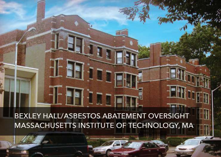
BEXLEY HALL/ASBESTOS ABATEMENT OVERSIGHT MASSACHUSETTS INSTITUTE OF TECHNOLOGY, MA