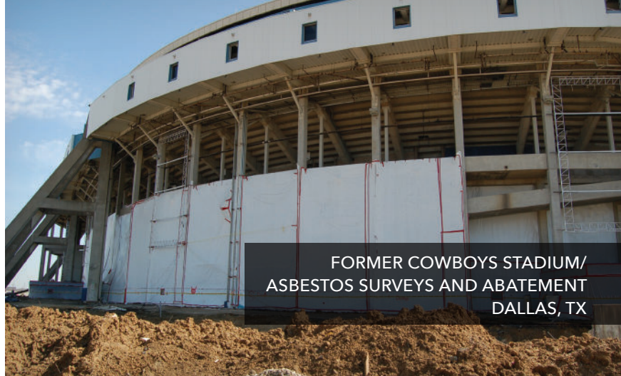
FORMER COWBOYS STADIUM/ ASBESTOS SURVEYS AND ABATEMENT DALLAS, TX