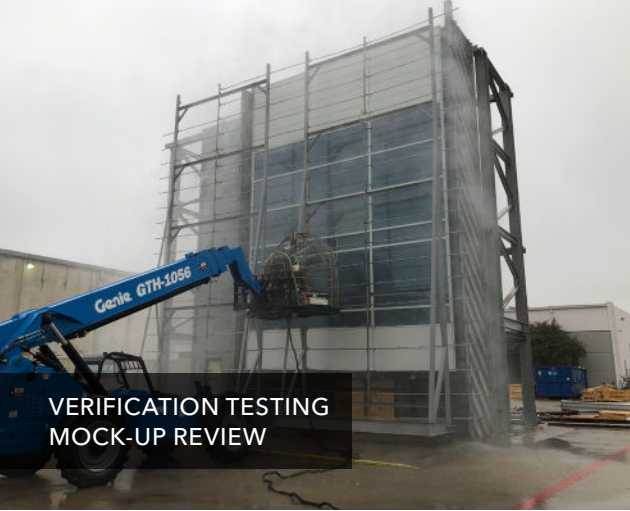
VERIFICATION TESTING MOCK-UP REVIEW