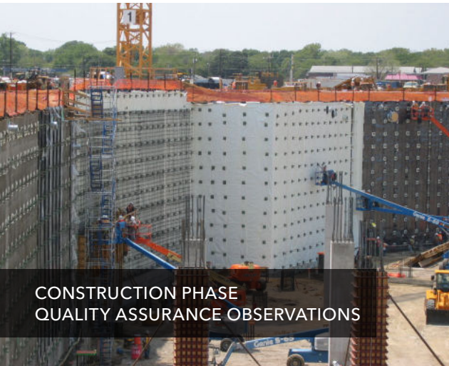
CONSTRUCTION PHASE QUALITY ASSURANCE OBSERVATIONS