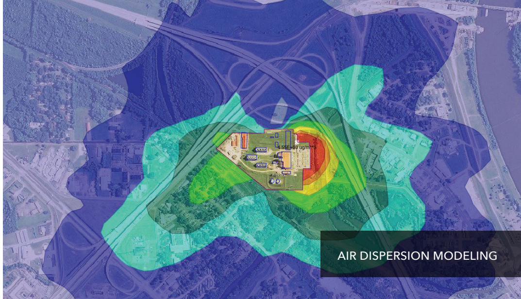
AIR DISPERSION MODELING