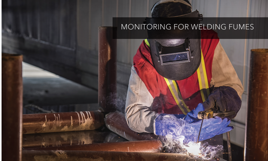
MONITORING FOR WELDING FUMES