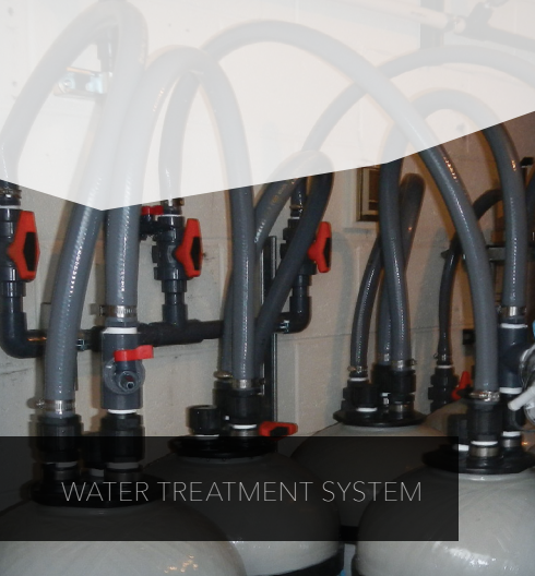
WATER TREATMENT SYSTEM