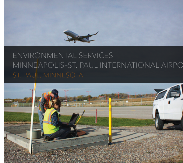
ENVIRONMENTAL SERVICES MINNEAPOLIS-ST. PAUL INTERNATIONAL AIRPORT ST. PAUL, MINNESOTA