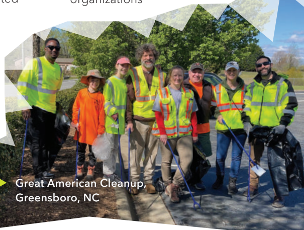
Great American Cleanup, Greensboro, NC

Sustainable and diverse supplier procurement practices implemented across our purchasing and real estate management platforms.